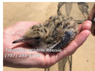
Tidewater Wildlife Rescue (757) 255-8710

A volunteer organization dedicated to assisting orphaned and injured wildlife throughout Tidewater, Virginia. Tidewaterwildliferescue@gmail.com